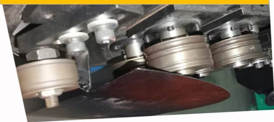
Technical parameters of servo circle machine

送线轮 光洁，耐磨，多线槽，精加工 wire feeding wheel is smooth, wear-resistant, multi trunking and finish machining