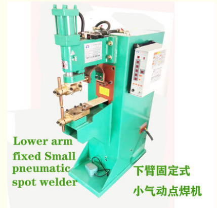
Lower arm fixed Small pneumatic spot welder